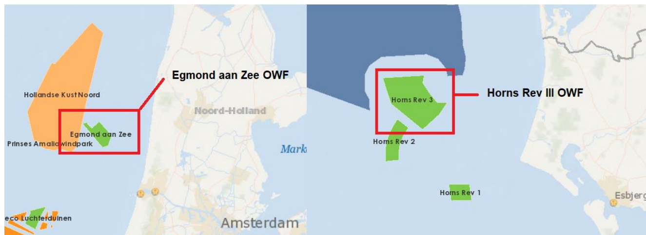
Figure 1. Location of the Egmond aan Zee (on the left) and Horns Rev 3 (on the right) offshore wind farms.

Egmond aan Zee is located 10 - 18 km off the Dutch North Sea Coast and comprises 36 wind turbines with scour protected monopile foundations (Figure 1, on the right). The selected hindcast data corresponds to the coordinates latitude of 52.606°N and longitude of 4.419°E. The hindcast data for this case study was obtained from CMEMS hindcast data and has a temporal resolution of 3 hours. The available time-series covered the period between 01-01-1980 to 31-08-2021, which resulted in 117120 pairs of significant height and joint peak periods. The water depth was assumed as 20 m and the remaining details for this case study are provided in Figueiredo et al. (2022).